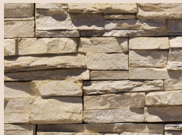
Dry Creek STACKED STONE