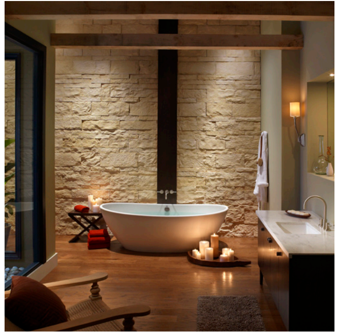
After: The ZenWall dramatically changes the mood of the room.