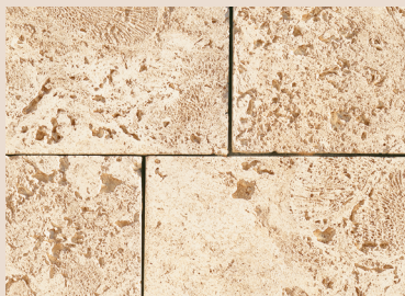
Pearl White COASTALREEF™