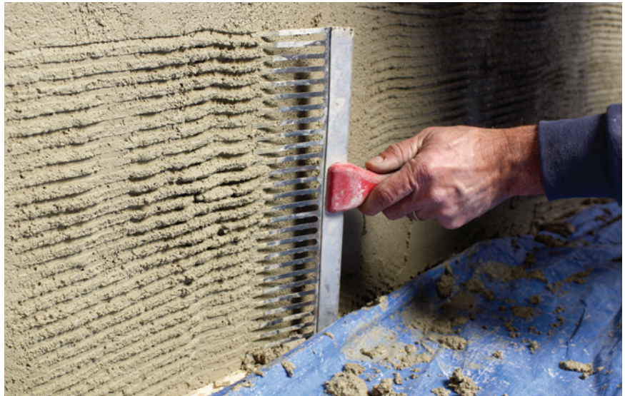
Score mortar horizontally.