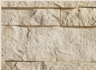
Oyster CUT COARSE STONE™

The ZenWall showcased in this Idea Book uses Oyster Cut Coarse Stone. You may wish to use a different profile. The following profiles and colors are also recommended. Please visit: www.eldoradostone.com to view additional options.