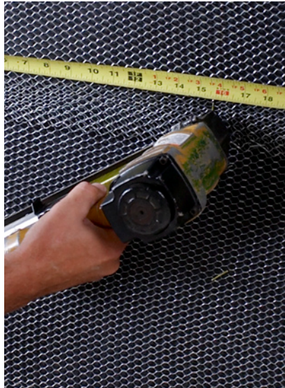
Attach lath to weather-resistant barrier.