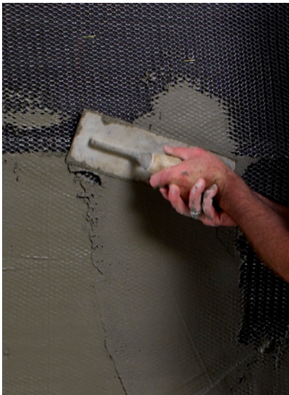
Cover entire lath with mortar.