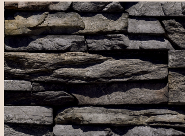
Black River STACKED STONE