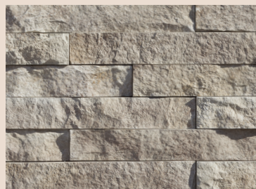
Birch LEDGERCUT 33