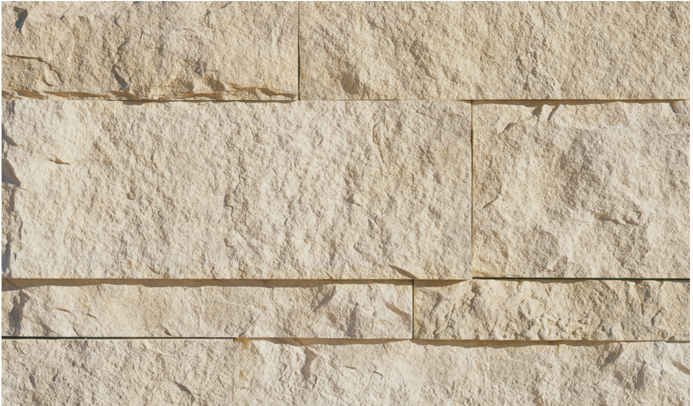
Dry-Stack grout technique with Oyster Cut Coarse Stone was specified for the ZenWall represented in this Idea Book.